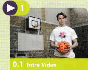
0.1 Intro Video

Hi, I'm Josh and I'm fifteen. I live with my mum, dad and sister. This is my bedroom. I love Saturday mornings. I get up late, have a big breakfast, and then I ... oh, that's my phone. What? Really? OK, give me ten minutes ... Sorry, my friend Adam is waiting for me. I need to hurry!